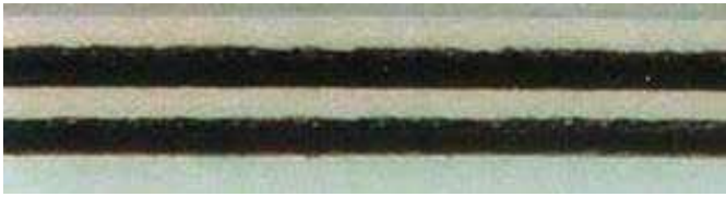
Welded with standard nozzle.