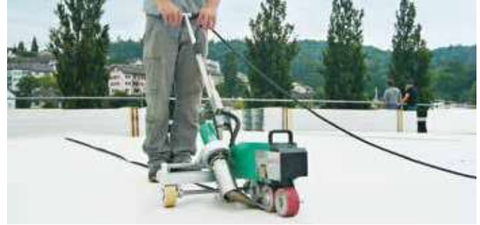
Highly reliable in application even at undervoltage.

Using the new VARIMAT V2, polymer roofing membranes can be welded more rapidly resulting in lower cost. Users appreciate its streamlined ergonomics and its ease of use. The clearly laid out operating unit's "e-Drive" allows for the control of all relevant weld parameters.