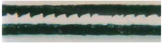
Welded with grip nozzle 25% higher weld seam strength. Mainly for TPO sealing sheets.